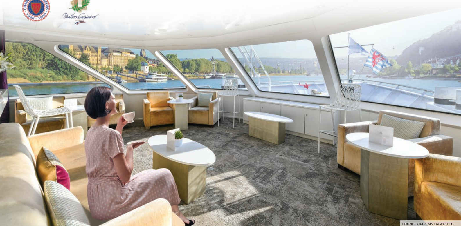
LOUNGE/BAR (MS LAFAYETTE)