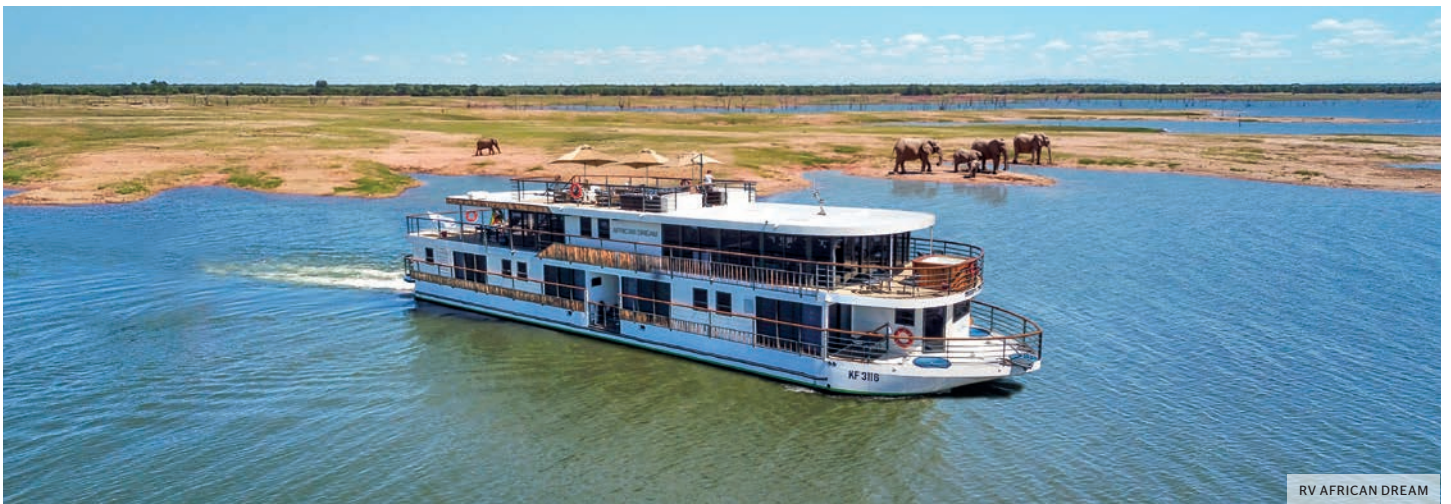
RV AFRICAN DREAM