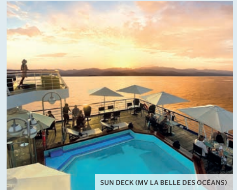
SUN DECK (MV LA BELLE DES OcéANS)