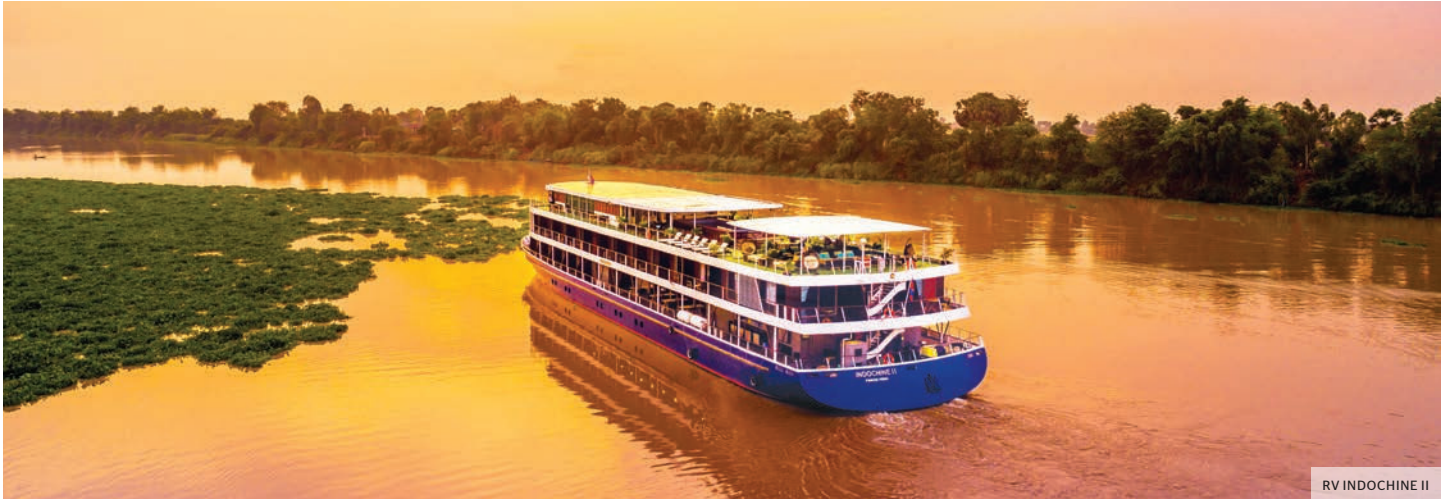
RV INDOCHINE II