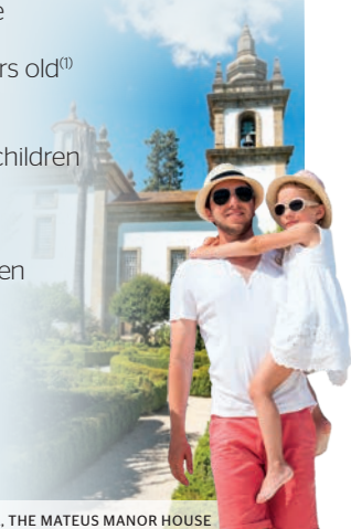
VILA REAL, THE MATEUS MANOR HOUSE

(1) Limited to 2 children per cabin occupied by at least 1 paying adult (excluding flights, taxes, transfers and excursions).