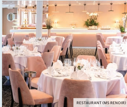
RESTAURANT (MS RENOIR)