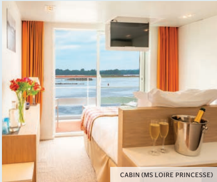
CABIN (MS LOIRE PRINCESSE)

Hotel and ship staff are at your service. Captains, pursers, entertainers, kitchen and dining room staff are all members of our crews. Experienced and English-French bilingual, they will give you their warmest welcome!