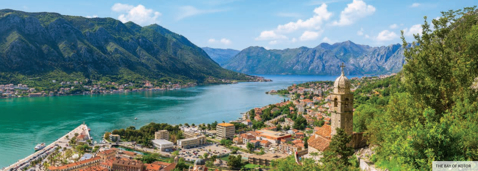
THE BAY OF KOTOR