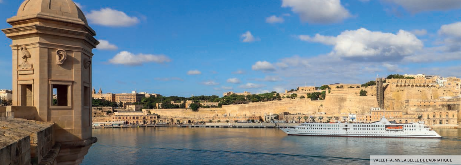
VALLETTA, MV LA BELLE DE L'ADRIATIQUE