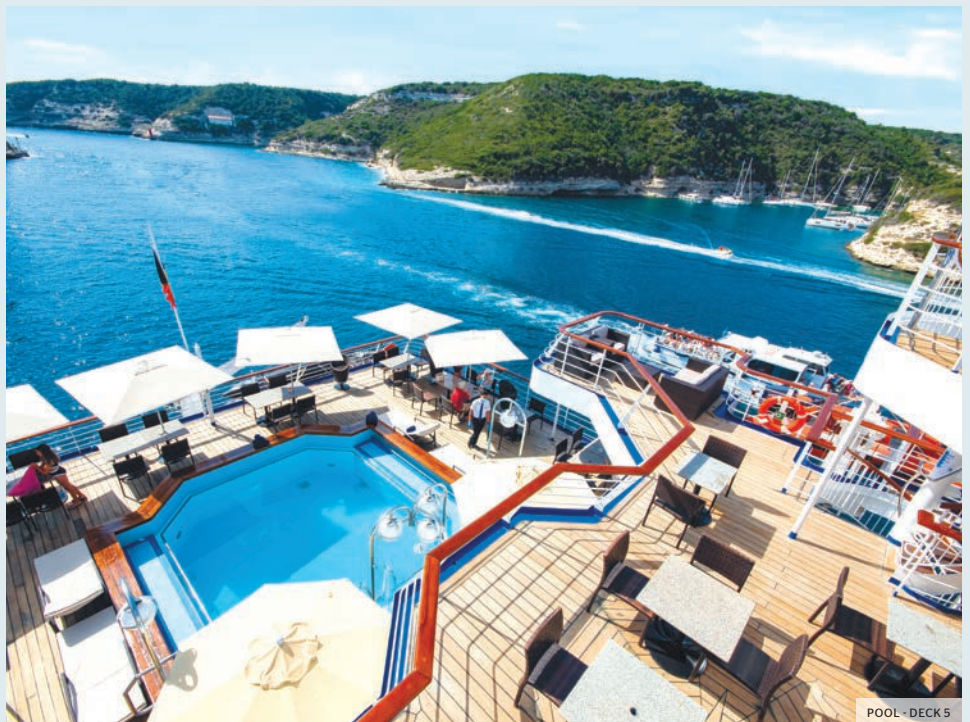
POOL - DECK 5