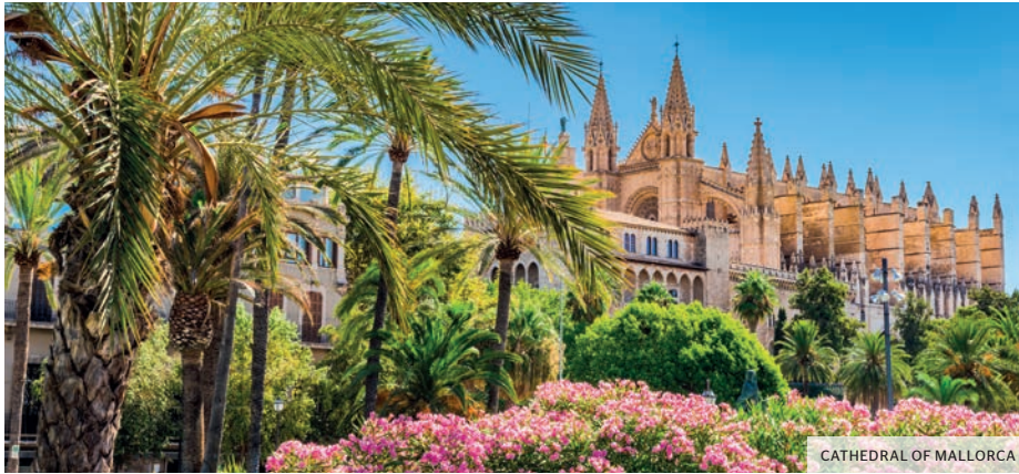
CATHEDRAL OF MALLORCA

Nice • Port Mahon • Palma de Mallorca • Ibiza • Barcelona