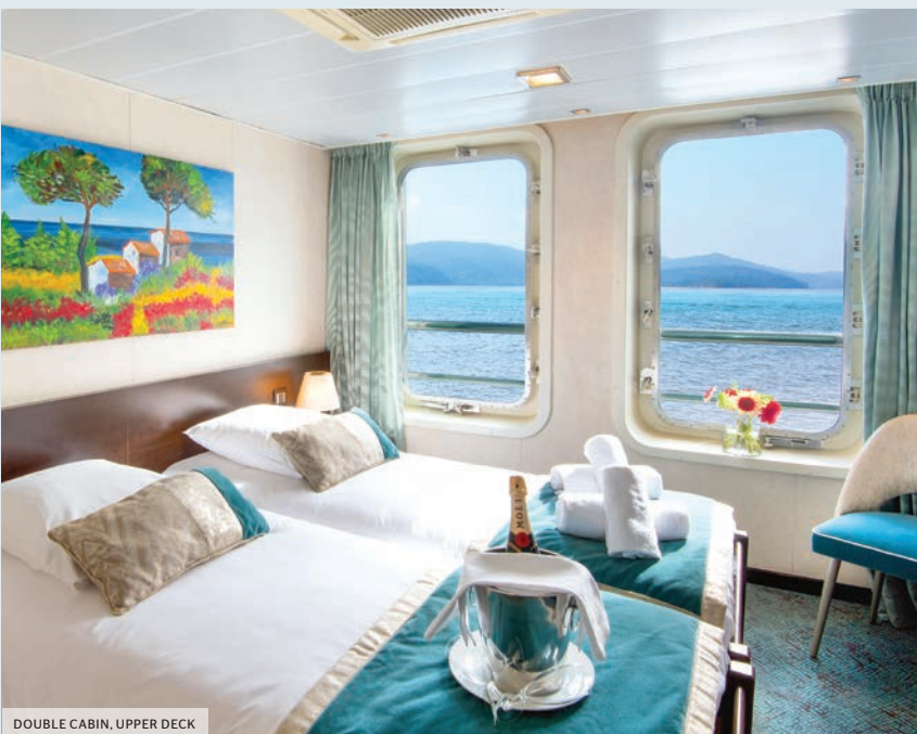
DOUBLE CABIN, UPPER DECK