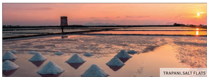
TRAPANI, SALT FLATS

Detailed programme, dates and prices on request.