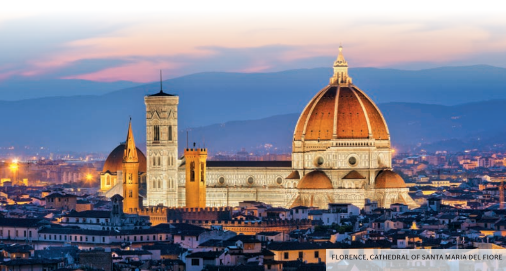
FLORENCE, CATHEDRAL OF SANTA MARIA DEL FIORE