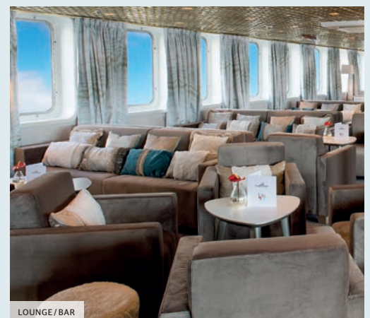
LOUNGE / BAR