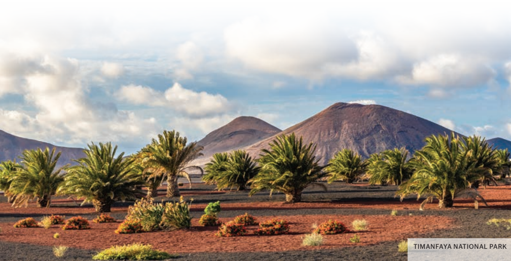
TIMANFAYA NATIONAL PARK

(1) Cruise in the opposite direction. (2) Optional excursions.