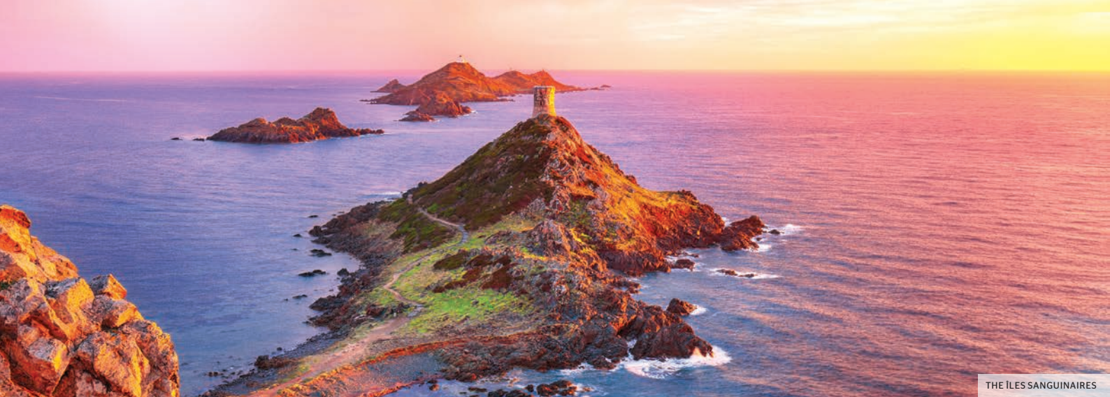
THE ÎLES SANGUINAIRES