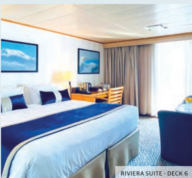
RIVIERA SUITE - DECK 6