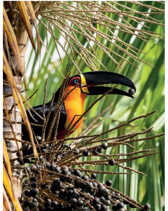
TOUCAN, AÇAÍ BERRIES