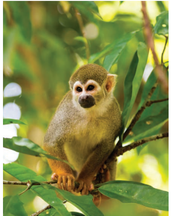
SAIMIRIS (SQUIRREL MONKEYS)