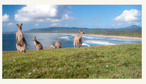
Kick back on Kangaroo Island

For the most up-to-date details and fares, visit HollandAmerica.com.