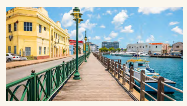
Explore historic Bridgetown, Barbados