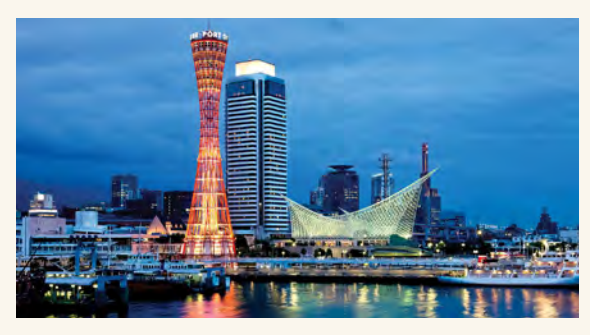
Marvel at modern architecture