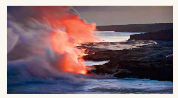
Discover Hawaii's fiery islands