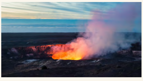
Kilauea Volcano, Hawaii