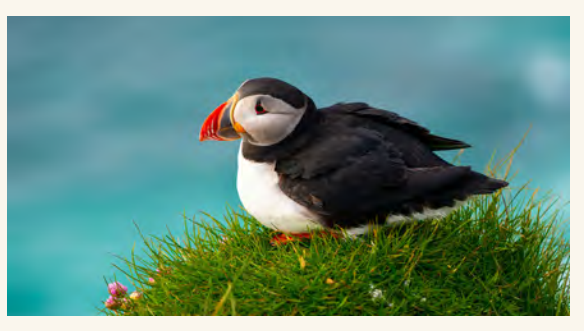
Admire colorful puffins at play