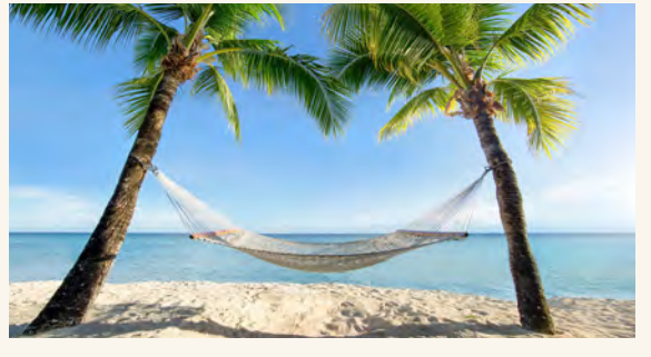
Wind down underneath palm trees