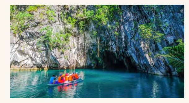
Puerto Princesa, Philippines