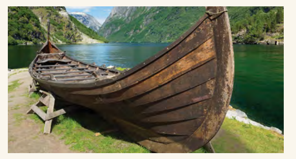
See perfectly preserved Viking artifacts