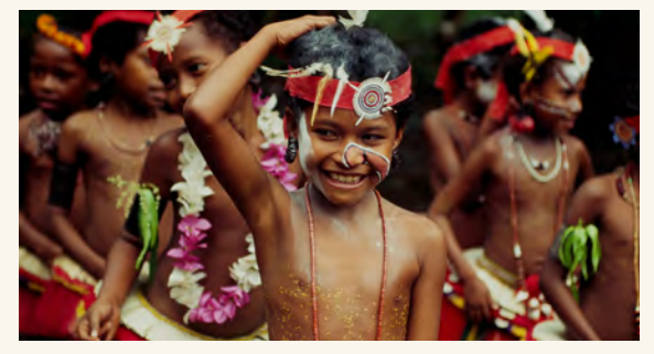
Make new friends in Papua New Guinea

Collect a lifetime's worth of memories as you cruise through majestic straits, volcano-laced seas and stunning coral reefs.