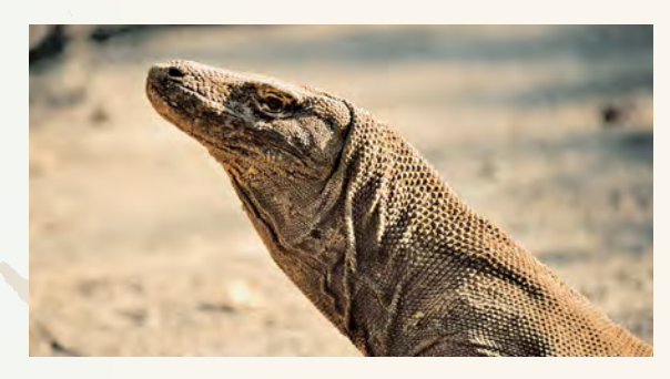
Meet Earth's largest lizards

VISIT HOLLANDAMERICA.COM OR CONTACT YOUR TRAVEL CONSULTANT TODAY.