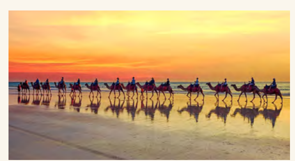
Enjoy a sunset camel ride in Broome

Encounter amazing wildlife, worldrenowned wines and the jaw-dropping Great Barrier Reef as you circle Australia.