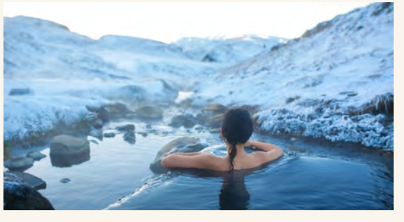
Immerse yourself in Iceland's majestic fjords