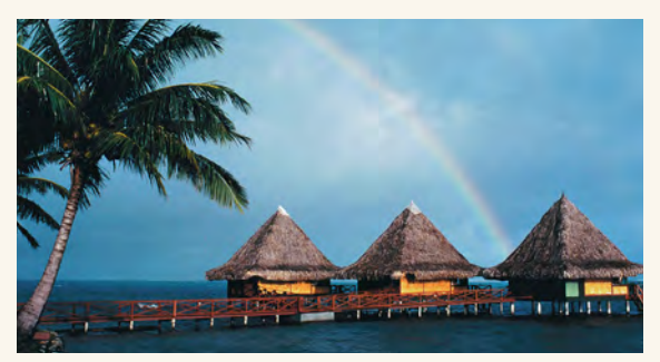
Bask in beautiful Moorea

Call on nearly a dozen beautiful islands as you traverse hemispheres and continents on this transpacific journey of discovery.