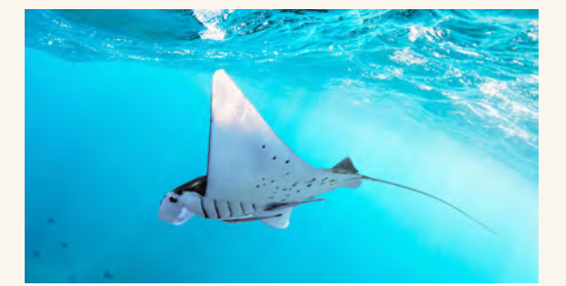
Swim with friendly stingrays