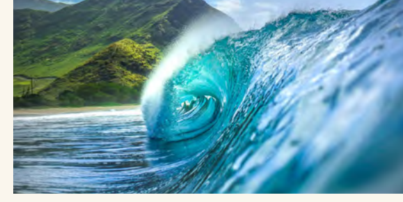
Soak in turquoise Tahitian seas