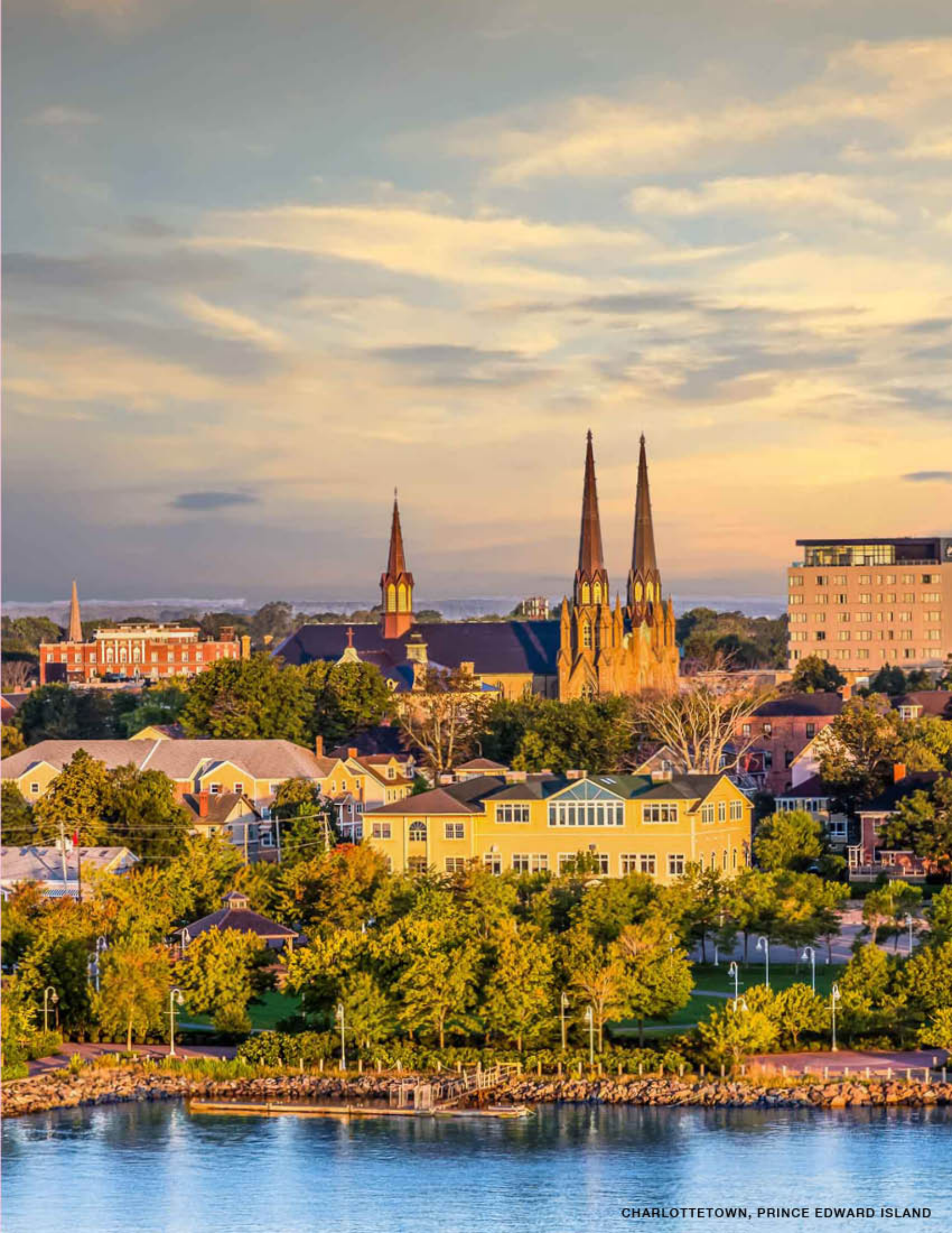
CHARLOTTETOWN, PRINCE EDWARD ISLAND