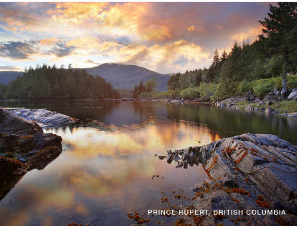
PRINCE RUPERT, BRITISH COLUMBIA