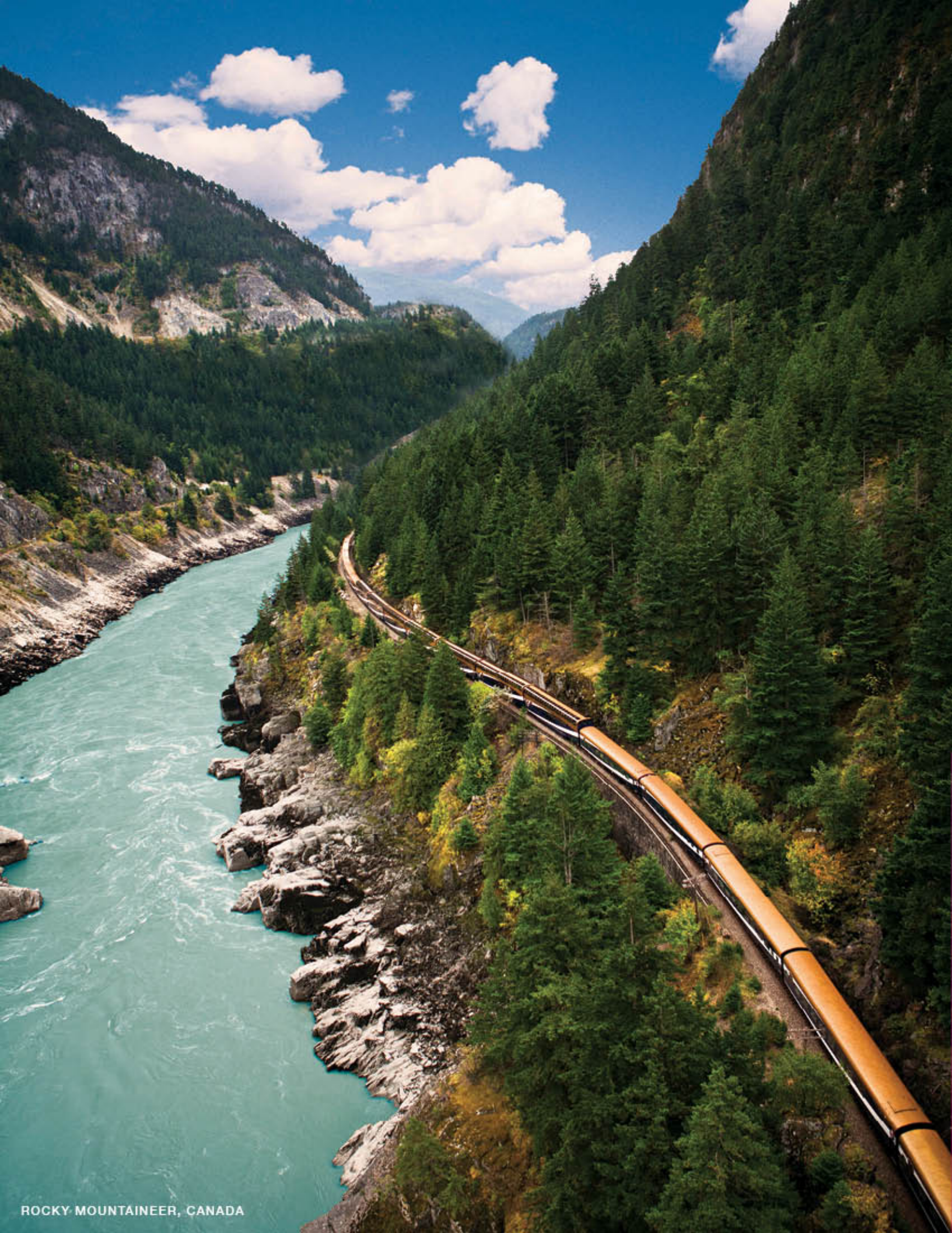
ROCKY MOUNTAINEER, CANADA