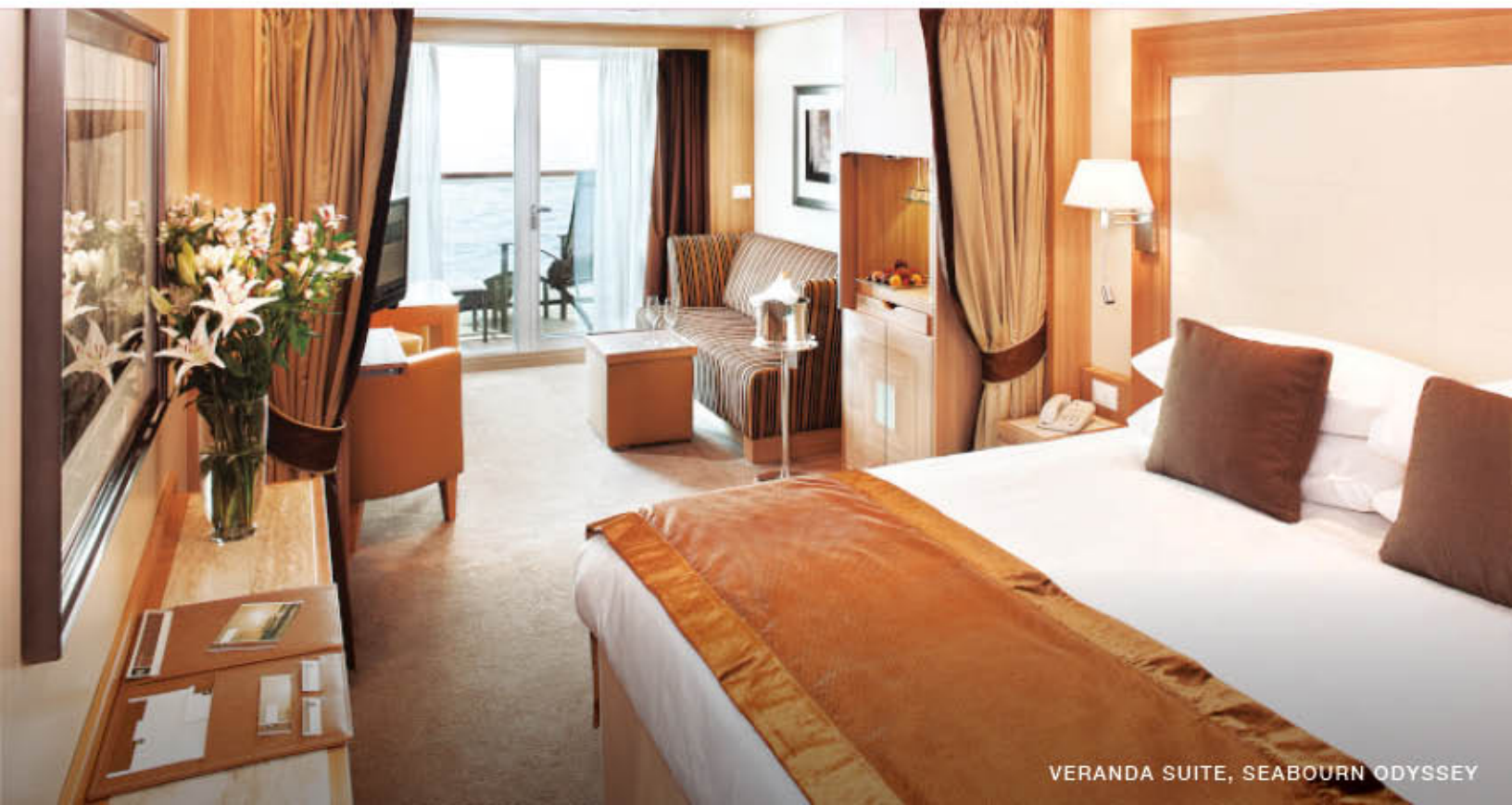
VERANDA SUITE, SEABOURN ODYSSEY