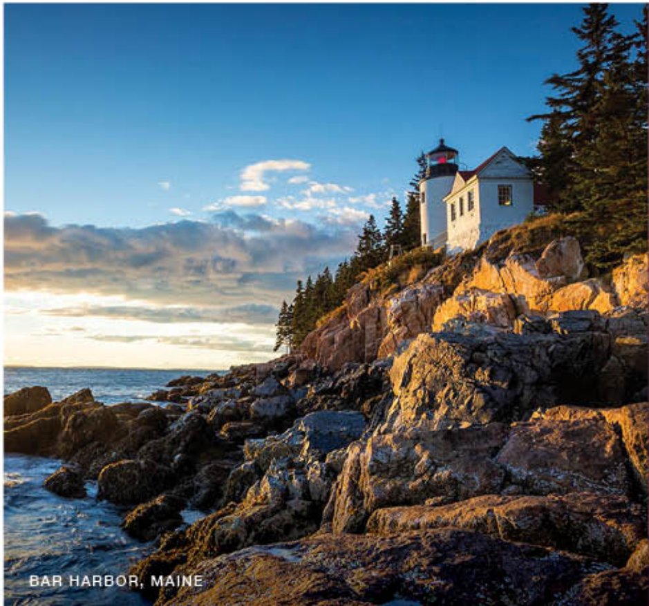
BAR HARBOR, MAINE