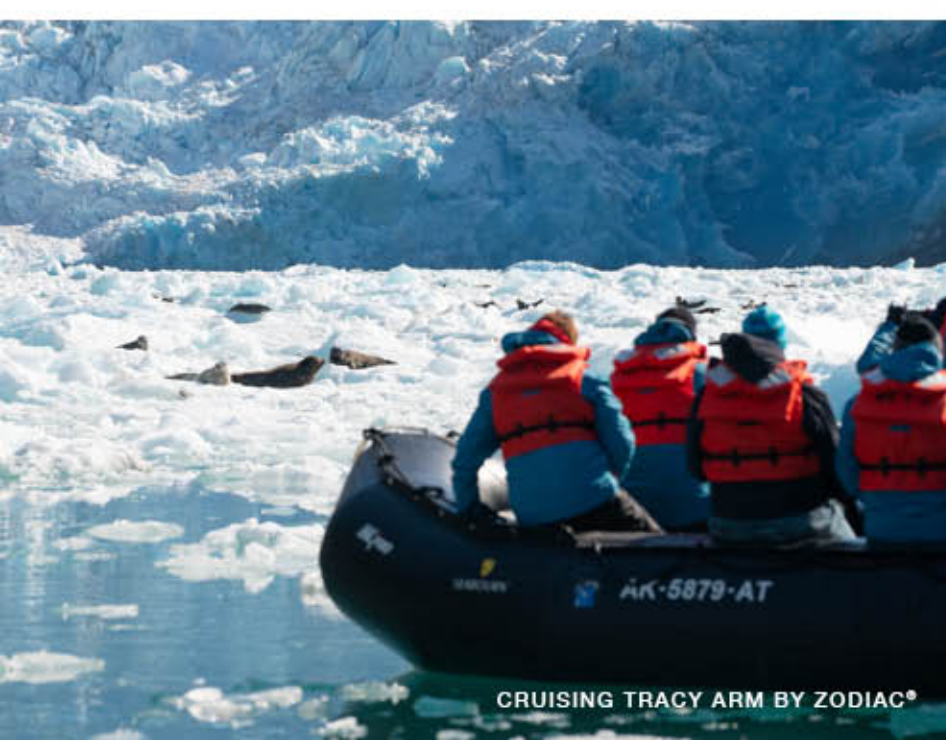
CRUISING TRACY ARM BY ZODIAC®