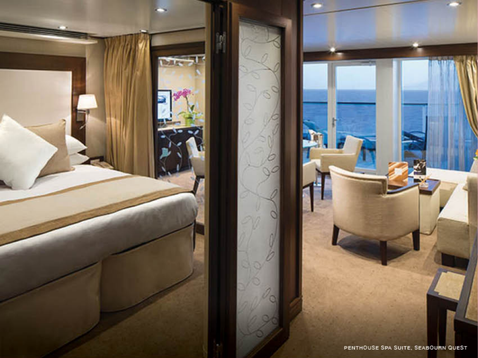
PENTHOUSE SPA SUITE, SEABOURN QUEST