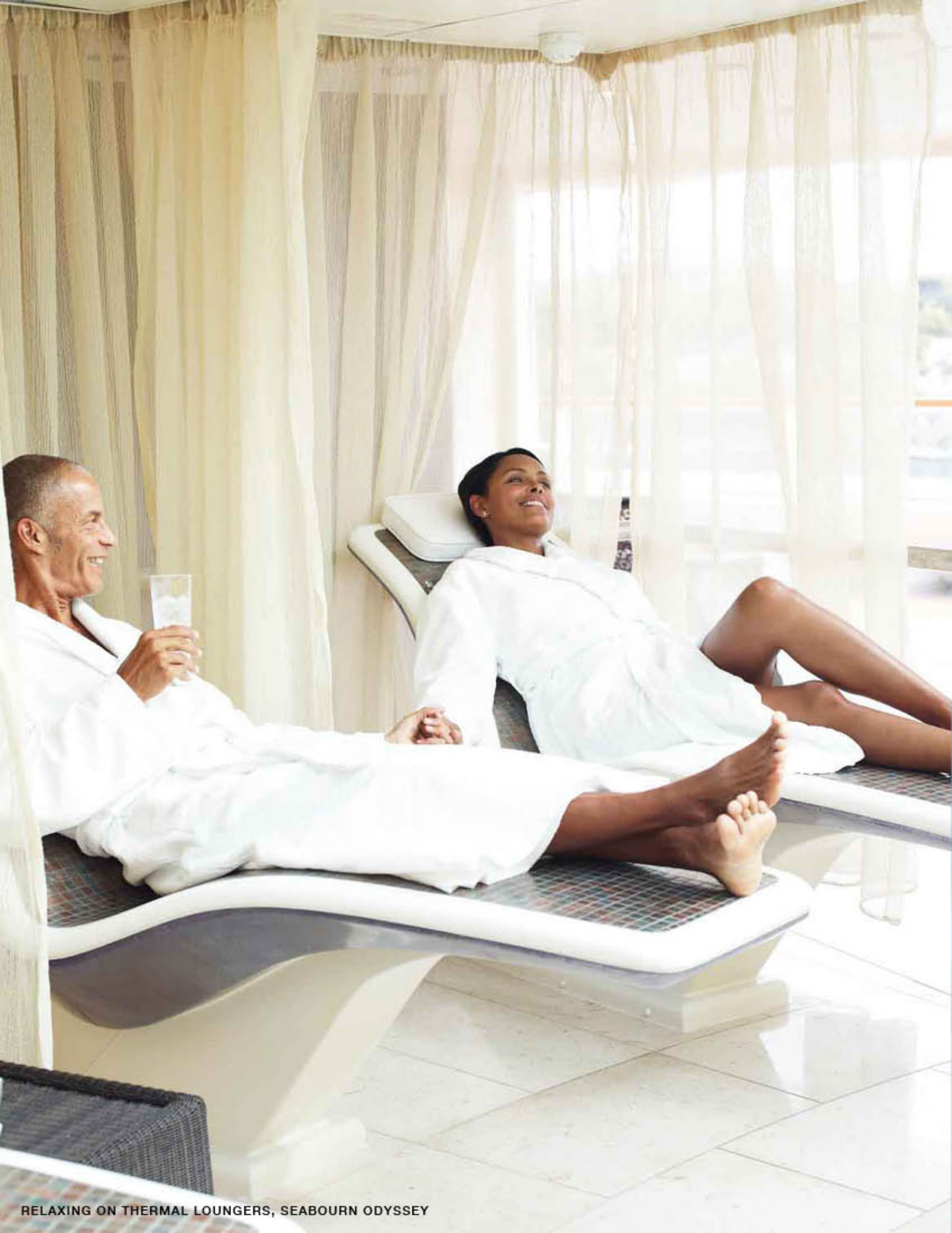
RELAXING ON THERMAL LOUNGERS, SEABOURN ODYSSEY