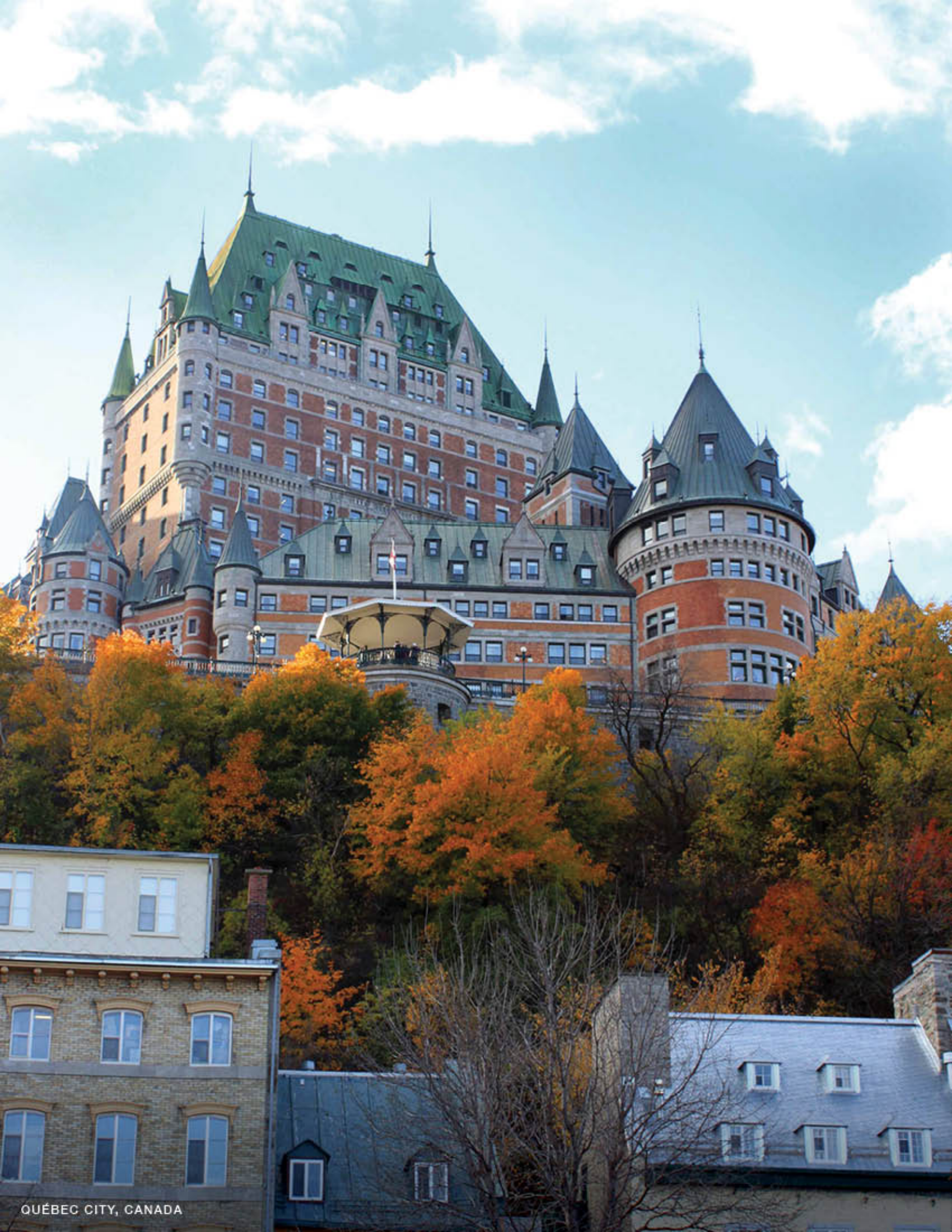
QUÉBEC CITY, CANADA