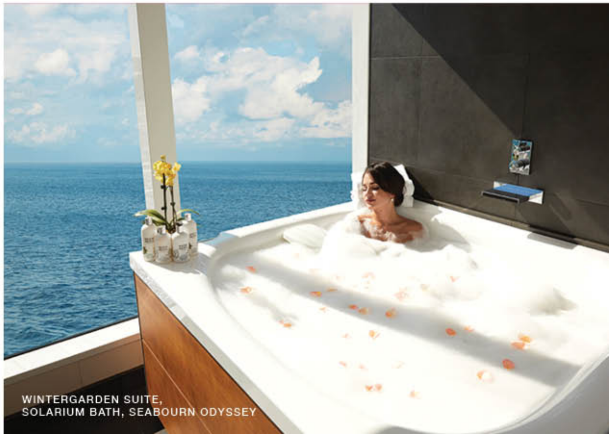
WINTERGARDEN SUITE, SOLARIUM BATH, SEABOURN ODYSSEY

Enter your spacious, light-filled suite to discover Welcome Champagne awaiting you on ice, and an in-suite bar fully stocked with your preferences. Tastefully designed and curated, most suites open onto private verandas. All feature walk-in closets; an entertainment system with TV; and a spacious marble bath with double vanities, a full tub, shower, designer soaps and a range of luxury bath products in signature scents created exclusively for Seabourn by Molton Brown, London.